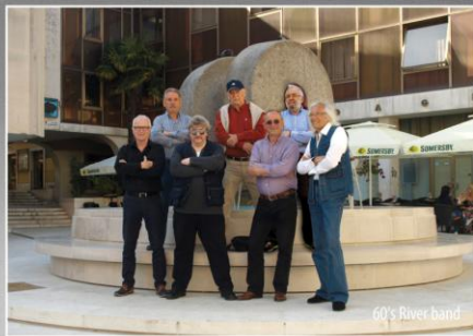
60's River band